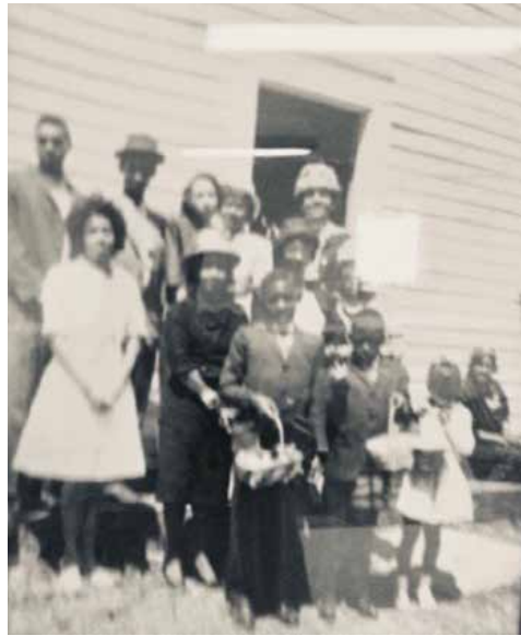
Figure 2 left. Scott's Grove Church Family Picture, 1950s-60s , collection Scott's Grove Baptist Church, Vincent, Alabama.