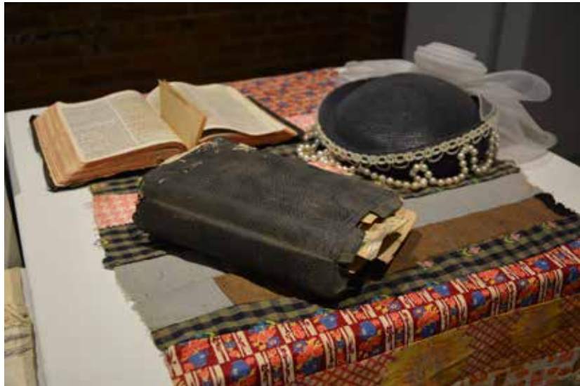
Figure 7, opposite. Tony Bingham, Old Scott's Grove Baptist Church Site / Daffodil Field , 2021, digital photograph.

I often wonder if materials hold memory. Do walls and floors “remember” who touched them or walked and danced along their polished planks? I pose this question to myself as I consider an approach to art based in an examination of history, or histories. As an African American artist, my practice is dedicated to discovering the legacies and experiences of black folks in the rural southern region of the United States, stories and experiences not typically considered part of the American story.