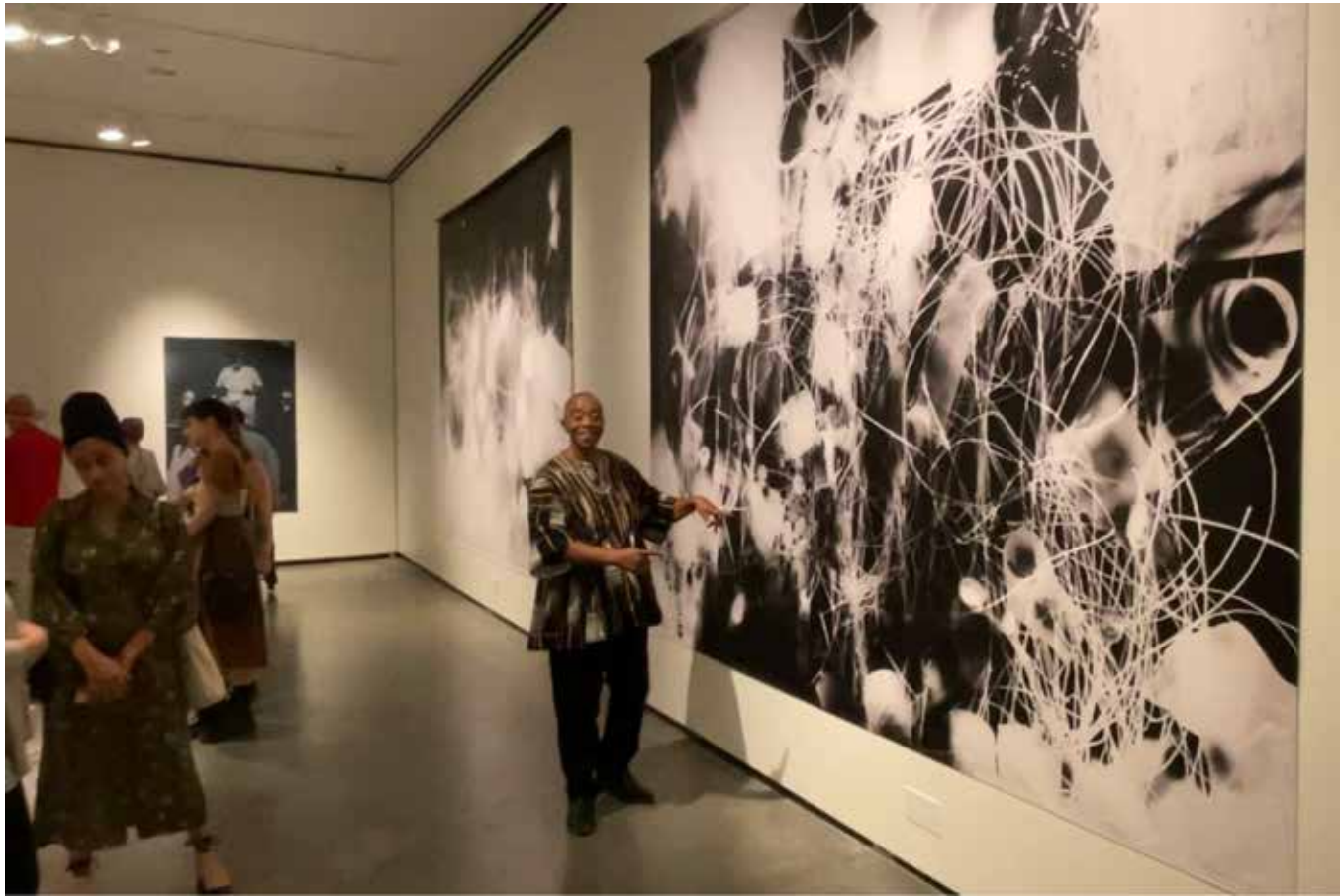
Figure 10. Installation view at opening day, 2022 Alabama Triennial, 2022.

In both teaching and in my own practice, I choose processes that invite viewer engagement. I have embraced the potential of creative processes working with limited financial resources. With pinhole photography, we use cameras made out of readily available materials and work with out-of-date photography papers, or improvised darkroom spaces. In stop-motion animation, we find new uses for obsolete camera equipment, out-of-date newspapers and magazines, old photographs and photocopies, as well as sculpture made out of materials at hand. We also use GIMP, a free open-source software program for working with photographs. Students create spoken-word audio tracks and edit their work using iMovie. In addition, we have worked with